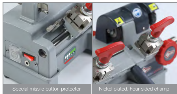
Special missile button protector

Easy to carry handle, Light weight machine 8.7kg / 19.2 lbs which makes it easy for 'On the Go Locksmithing'.